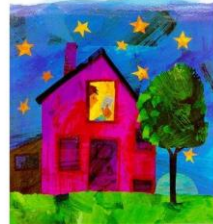
The Secret Birthday Message By Eric Carle

Reinforce the use of "positional words".