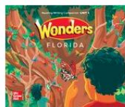
Grade 1 Wonders FL Teacher Edition